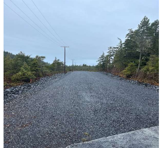
Top Left and Right: Mt. Dewey Trail Extension Project/ Bottom Left: Solid Waste Transfer Station Loading Dock/Bottom Right: 6 th Avenue Road Construction.